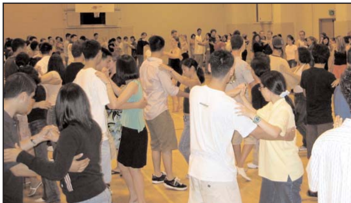
Dancers rumba at Hot Latin Night.